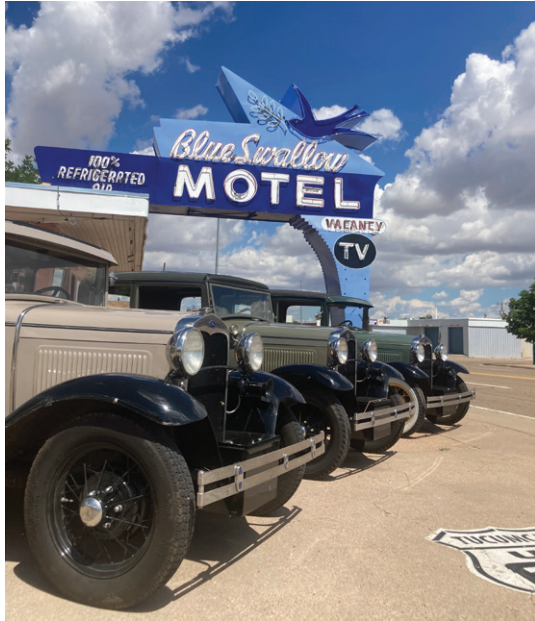
Three classic Model A's parked at the Blue Swallow Motel in Tucumcari, New Mexico. The refurbished motel matches its first year in 1939.

Just over a year ago, knowing they were taking their vintage Model A Fords on a National Ford Model A tour of northeast states, eight members in the Santa Maria Model A Ford Club pondered the question; "Why not drive Model As back to our homes on the Central Coast? We could drive most of the way on historic Route 66".