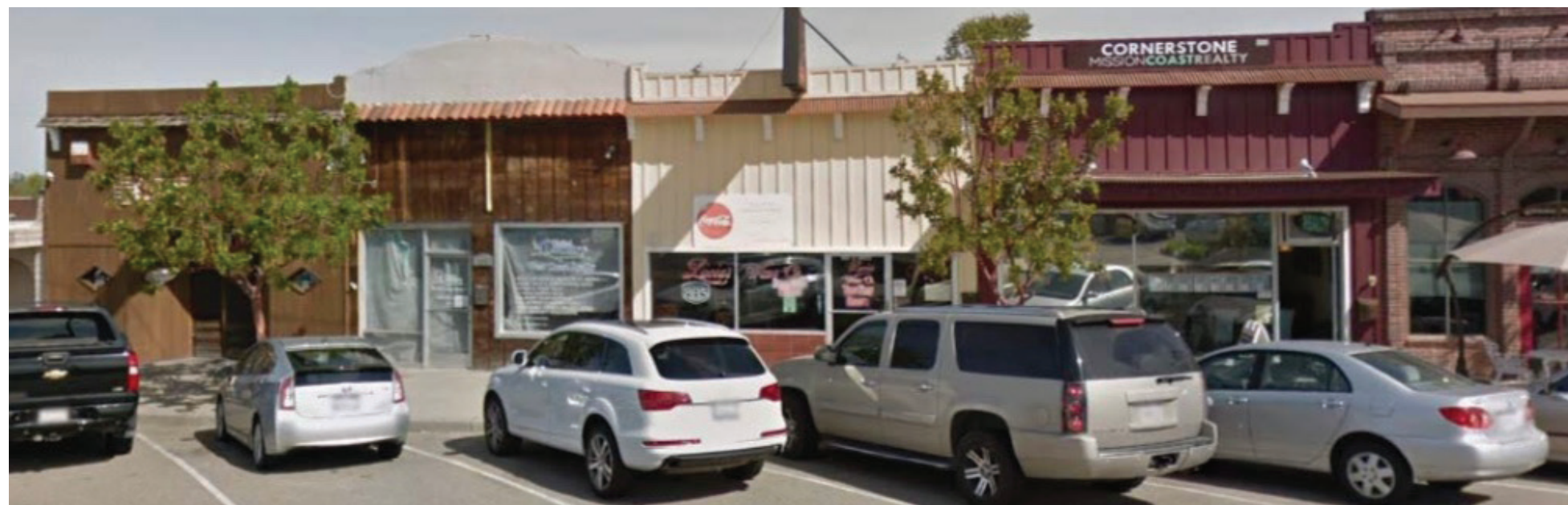
From the Earth is proposed to sit on East Clark Avenue between Elmer's and Pizzeria Bello Forno.

A cannabis delivery service is unlikely to have a future on East Clark Avenue because it's inconsistent with the community's vision, according to the Santa Barbara County Planning Commissioners.