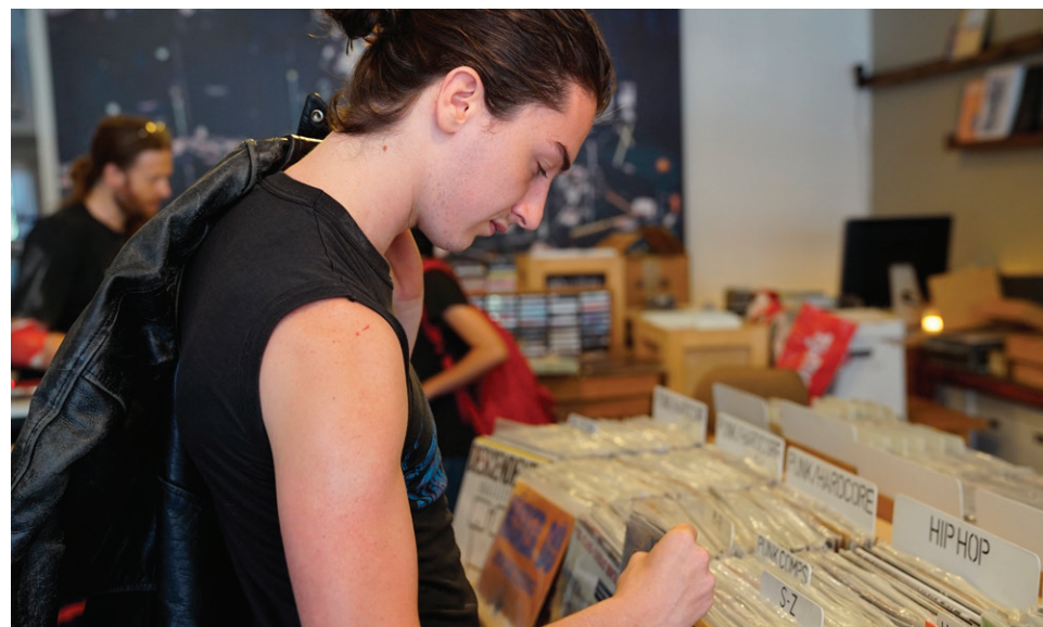
Scene from COAST being shot at Paradise Trading Post and Record Store in Orcutt.