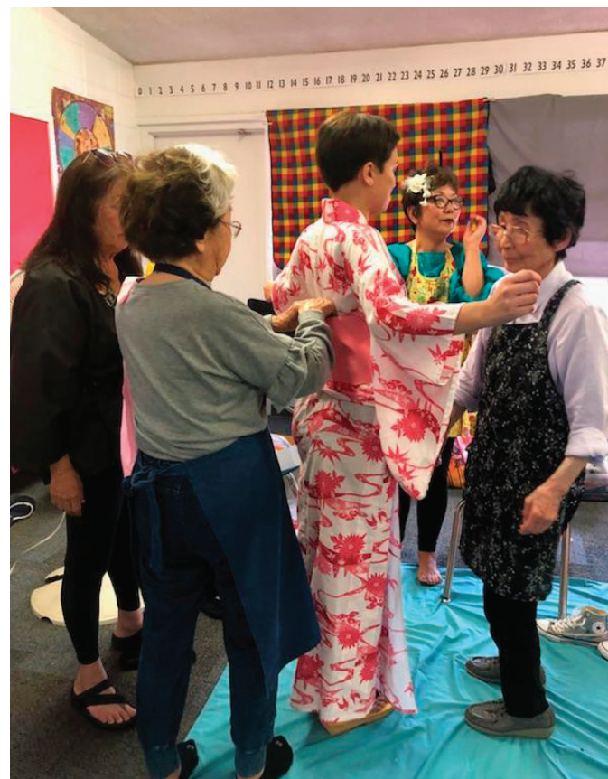
Cast prepares for shooting a scene for COAST being shot here in Orcutt

support from the local community. Working with Women Make Movies a 501 c (3) non-profit organization, COAST is accepting tax-deductible donations that will help off-set California's high production costs. Women Make Movies is a multicultural, multiracial, non-profit media arts organization which facilitates the production, promotion, distribution and exhibition of independent films and videotapes by and about women. Donations accepted here: http://www.wmm.org