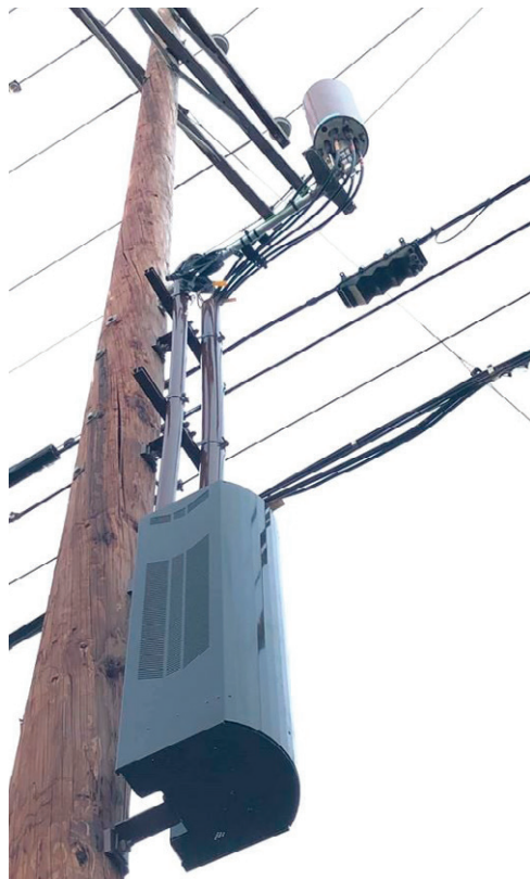
5G Equipment on Standard Utility Pole