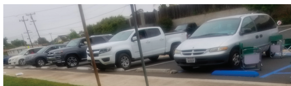
About twenty vehicles Sunday March 9 in the parking lot of Orcutt Christian Church worshipping inside their vehicles

The eighty-four year old minister, who has been serving the local congregation for twenty three years, has built a