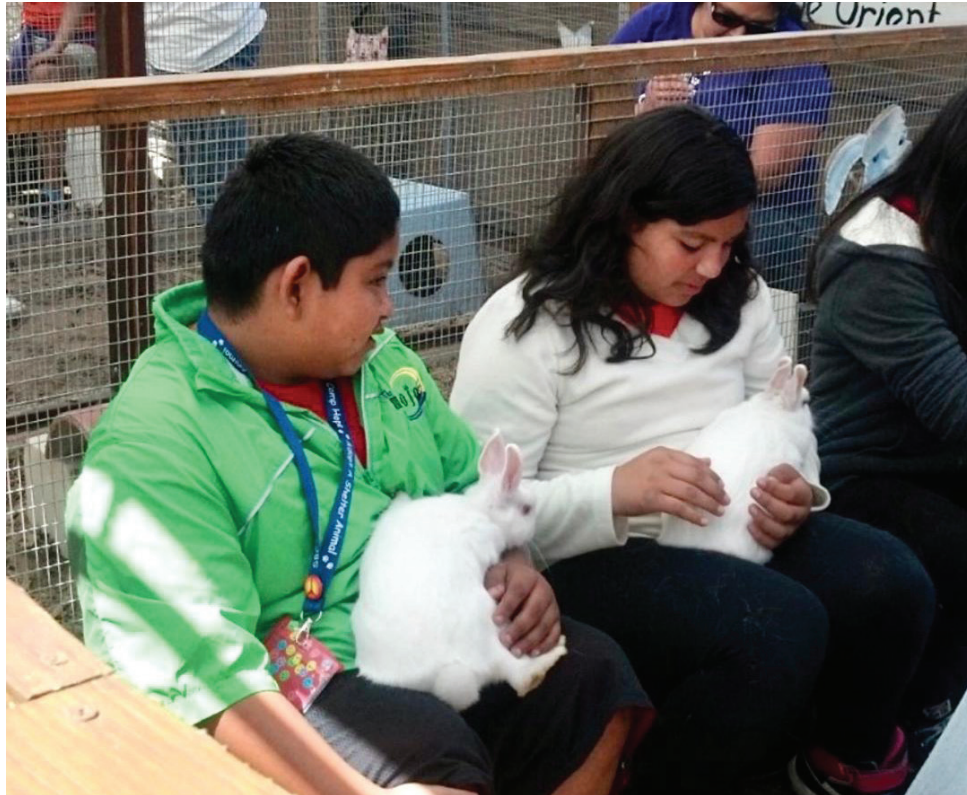
Camp HOPE campers learning the importance of proper bunny handling skills.

Created in 2009, Camp HOPE, an acronym for Humane Outreach Through Progressive Education, focuses on educating children in hopes of creating a generation of adults who will help solve problems faced at animal shelters in the future. Santa Maria and the surrounding unincorporated areas account for 50 percent of Santa Barbara County's shelter population of stray and abandoned animals.