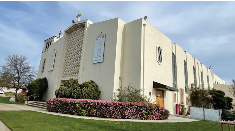
60 year old St. Louis De Montfort church and school on Clark Ave. in Orcutt is in a capital campaign for $4 million in improvements.

With beginnings six decades ago in a quonset hut near the Santa Maria Airport, St. Louis De Montfort Catholic Church has long been a staple of the Orcutt community. Father