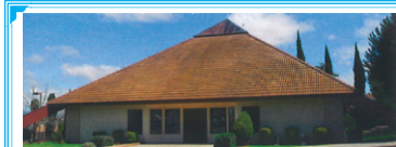
UNITY CHAPEL OF LIGHT Service 11 a.m. Sundays 1165 Stubblefield Rd. Orcutt, California