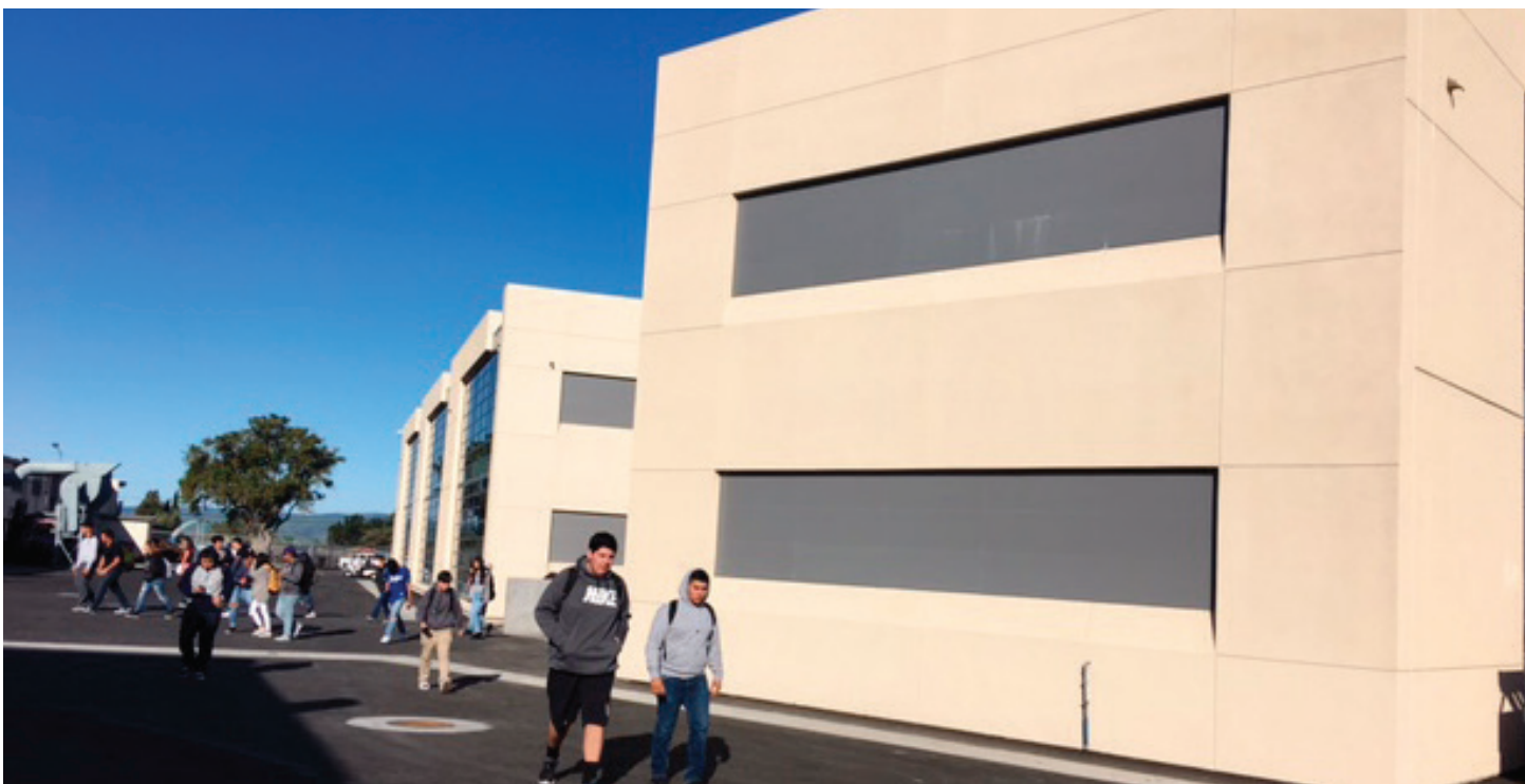
Students head to class at the new classroom complex at Righetti High School.

“Over the next three years, we will see this building open, the remaining classrooms renovated, and the portables removed to reclaim campus parking. This project will benefit students, staff and the community.” The long range plan is to remove all portable classrooms, renovate the permanent structures, including adding air conditioning.