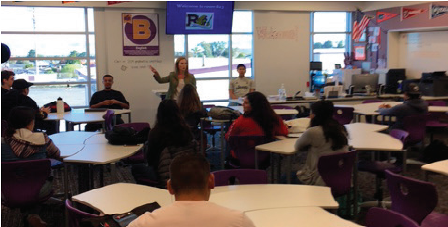
The new classrooms are designed to be flexible for teachers and students.