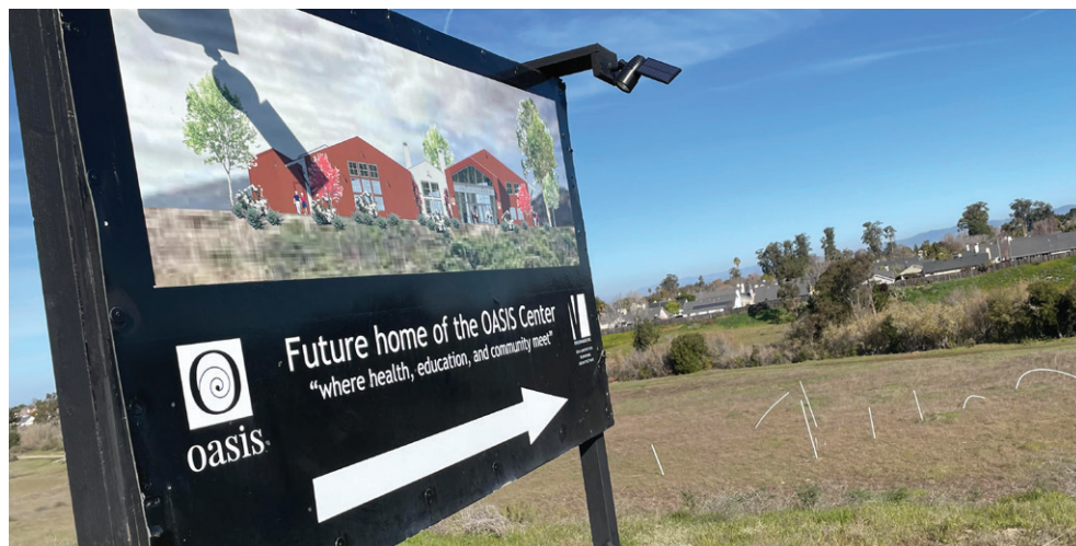
Sign on Clark Avenue pointing to Orcutt Creek and future site of the OASIS Center.

On December 7, 2021, after over a decade of planning, the Santa Barbara County Board of Supervisors unanimously approved building of a new facility for the OASIS Center. Now the official launch of the capital campaign has begun. The objective is to begin construction of the 15,900 square foot community center by year's end.