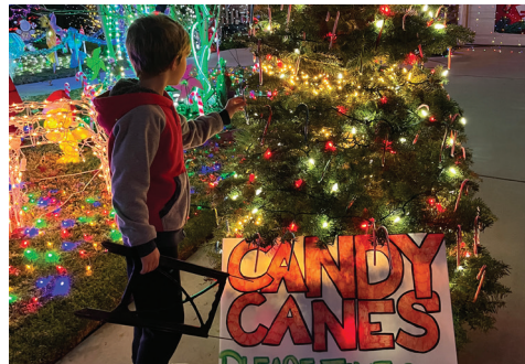
955 Briarcliff THE GINGERBREAD PALACE AWARD Award Sponsored by Cups & Crumbs and Homestead

Our judges were wowed by this delightfully decked house. Meticulously placed lights beam from the eaves and wrap around the lawn, while funny inflatables catch the eye (our favorite is the snowman who has lost his nose to a rabbit and his arm to a puppy). This is the type of Christmas Cottage everyone will appreciate.