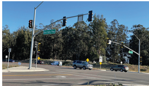
Property at UVP & Hwy 135 may be rezoned for affordable housing.

The property east of the intersection of the Union Valley Parkway and Highway 135 stretching east past Hummel Drive and the proposed Santa Barbara County fire station 26 (about a half mile from the intersection) has been recommended to be rezoned for affordable housing.