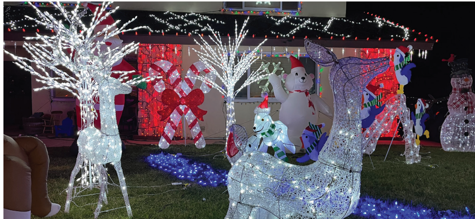
4198 Woodland—BEST IN SHOW: The Clark Griswold Award of Excellence Grand Prize Award Sponsored by One Capital Management

As you slowly drive down the road, you can see this beacon of Fa La La as though Clark Griswold himself hung each magnificent light. The beautifully crisscrossed roof, the shimmering arches, and the techno-themed trees set this house apart as one of a kind.