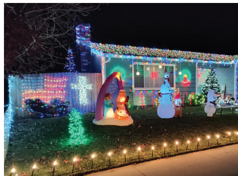
4745 Crestmont COZY CHRISTMAS AWARD

As you slowly drive down the road, you can see this beacon of Fa La La as though Clark Griswold himself hung each magnificent light. The beautifully crisscrossed roof, the shimmering arches, and the techno-themed trees set this house apart as one of a kind.