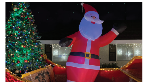
1215 Royal Oak CHOO CHOO EXPRESS AWARD

Tune your radios and enjoy the sounds and sights of this holiday eyecatcher. Arches that seem to dance like a fountain, playful penguins, and a jolly (and chatty) Santa bring a little extra cheer to this crowd pleaser.