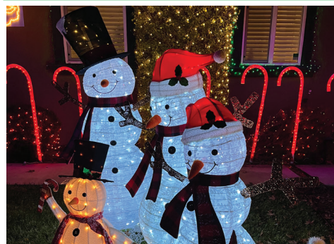
4609 Royal Oak ROCKIN' AROUND THE CHRISTMASTREE Award Sponsored by Company's Coming

Tune your radios and enjoy the sounds and sights of this holiday eyecatcher. Arches that seem to dance like a fountain, playful penguins, and a jolly (and chatty) Santa bring a little extra cheer to this crowd pleaser.