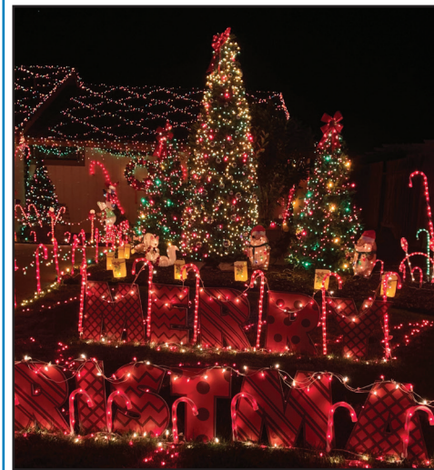
2021 Griswald Award of Excellence, 4223 Arroyo Court

"The Orcutt Fa La La Awards" celebrates its tenth year of holiday cheer!