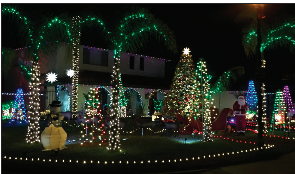
2017 Griswald Award of Excellence Winner 987 Old Mill Lane