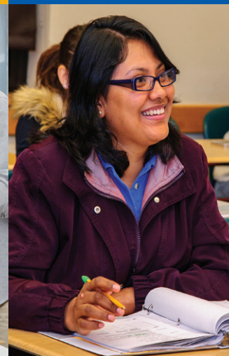
ENGLISH AS A SECOND LANGUAGE