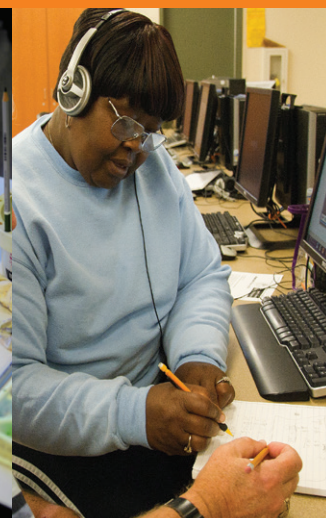
COMPUTERS AND YOU