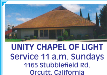
UNITY CHAPEL OF LIGHT Service 11 a.m. Sundays 1165 Stubblefield Rd. Orcutt, California

Oak Veneer Entertainment Center, 6' tall x 5' wide-$50. Bookshelves, 6' tall, $35 each. James, 805-878-1739