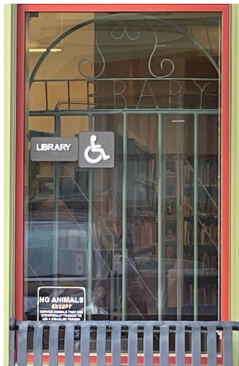
This gate welcomed visitors to the Orcutt Branch library in the 1930s.

The first library that served Orcutt patrons during the 1930's was located in a house at 200 South Broadway at the corner of Clark Avenue in Old Town Orcutt where a mobile home park is now.