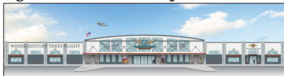
Artist rendering of proposed museum.

The Museum is home to a great many artifacts, memorabilia, uniforms, and documents, most of which are not on public display due to inadequate display spaces. The expansion, Hinton insists, will make these collections more visible and accessible to