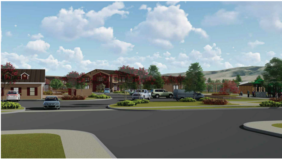
Artist rendering of project looking south from Soares Ave.

The district is hoping to offer classes in hospitality, recreation and the medical