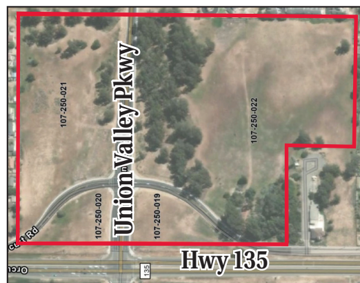
Red outline indicates area under consideration for annexation by the City of Santa Maria.

The City of Santa Maria is considering annexing 44 acres at Highway 135 and Union Valley Parkway and allowing a developer, Richards Ranch LLC of San Luis Obispo, to proceed with an application to develop 16 acres for commercial use, 18 acres for 400 apartments and 9 acres for ninety-five townhomes. The project would span both sides of UVP east of Highway 135.