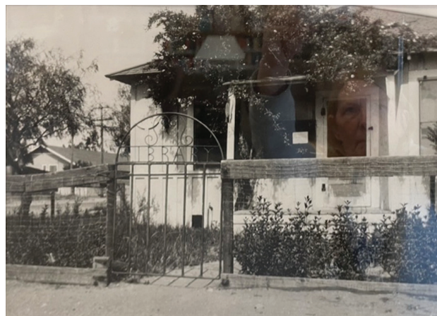
This gate welcomed visitors to the Orcutt Branch library in the 1930s and is now on display at the current library.