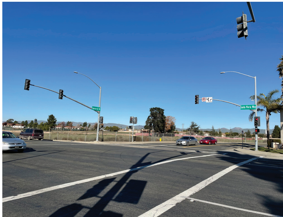
Construction of the new DMV office begins this summer at the northeast corner of Santa Maria Way and Sunrise Drive.